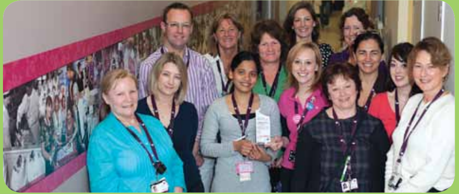
Some of the Newborn Intensive and Special Care team with their Public Healthcare Award trophy

To subscribe/unsubscribe to this newsletter, please send your full name and address to admin.foundation@thewomens.org.au or phone (03) 8345 2954.