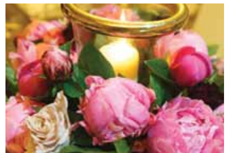
The Myer Mural Hall was decorated with beautiful flower displays kindly provided by Flower Temple. For more photos and information on the event, visit the Women's Gala Ball webpage: www.thewomens.org.au/GalaBall2011